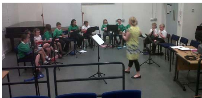
Picture 4: Wistaston Green Primary School recording Buzzin's heritage song, "Crewekelele" at our studios on the MMUC campus