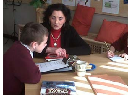
Pictures 7 and 8 are of Monks Copenhall Primary School interviewing Elders from Crewe about their memories