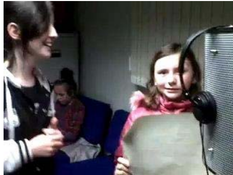
Picture 6: Some Bronze Arts Awards peer to peer mentoring in a MC session at the Sherborne Bungalow Youth Club