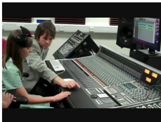
Picture 15: Young artists from Wistaston Green Primary School's eukelele band being shown the ropes in our SSL control room