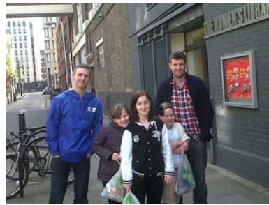
Picture 1: Sherborne Bungalow Youth Club's trip to The Women's Library in London