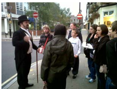
Picture 2: Sherborne Bungalow Youth Club and the Buzzin' group on a Victorian tour of Crewe