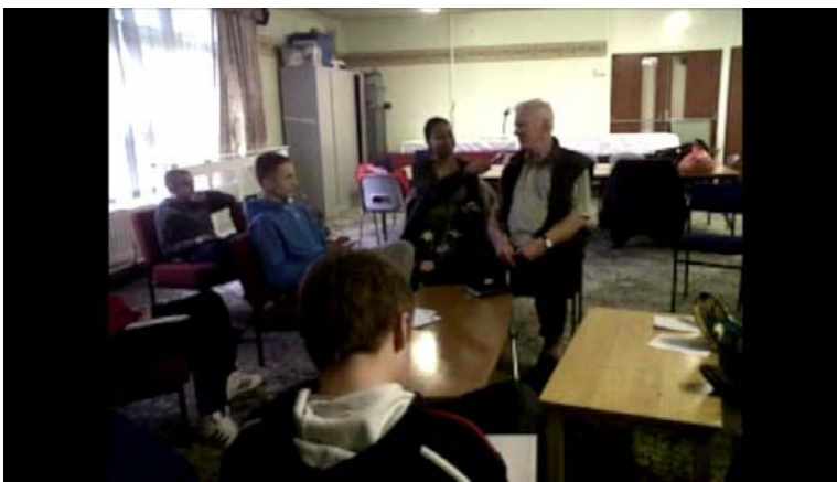
Picture 14: The RESPECT team from the Cheshire Fire Service interviewing an Elder about his memories of Crewe’s popular music in the 1950s